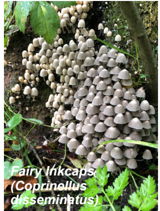
Fairy Inkcaps (Coprinellus disseminatus)

edible fungi in the surrounding woods and fields over the years, from an area studded with Chanterelles ( Cantharellus cibarius ) in Hollows Wood, to a large growth of Chicken of the Woods ( Laetiporus sulphureus ) last year. This October, we found a