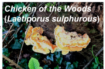
Chicken of the Woods (Laetiporus sulphureus)