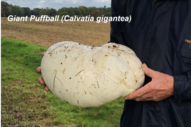
Giant Puffball (Calvatia gigantea)