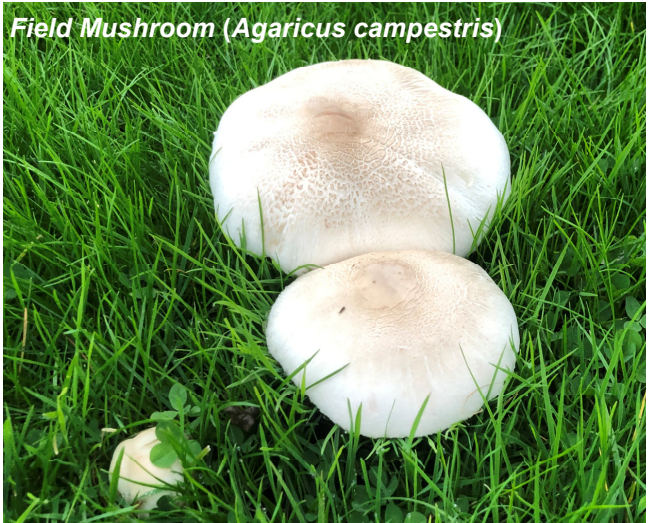
Field Mushroom (Agaricus campestris)

Stainer ( Agaricus xanthodermus ). This looks very like the Field mushroom, but may be identified by the way it turns vibrant yellow when cut through the stalk or bruised. The aroma of the Yellow Stainer is unpleasant, carbolic, chemically or inky compared to the