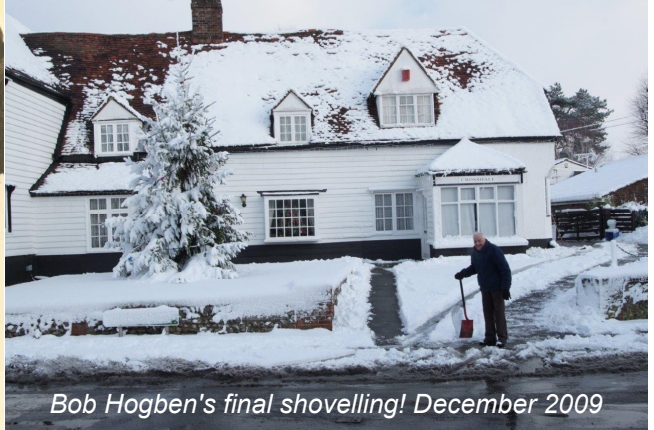
Bob Hogben's final shovelling! December 2009