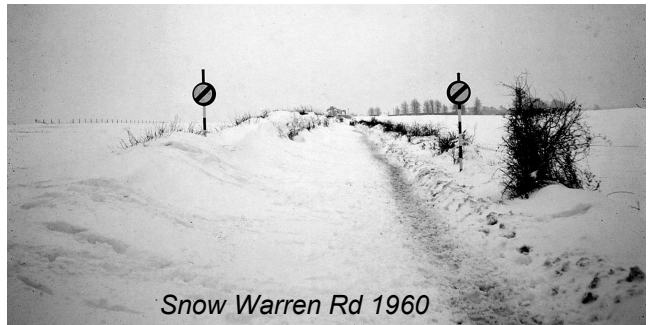
Snow Warren Rd 1960