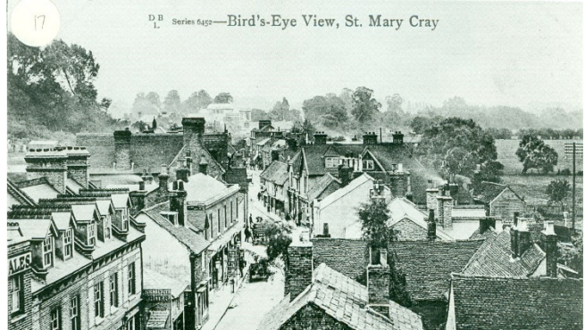
St Mary Cray High Street c1900 looking from the viaduct towards Orpington