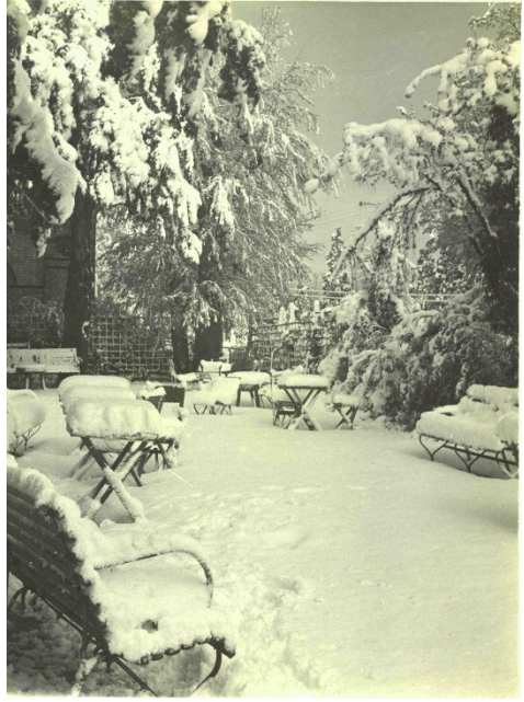
Two seasonal photos connected to the Five Bells. The back garden in 1950 and a patrons walk down Chelsfield Lane in 1935. Publican there somewhere I suspect (F Mills)