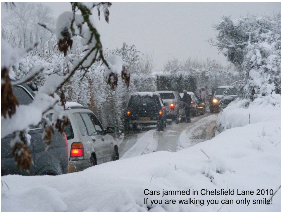
Cars jammed in Chelsfield Lane 2010 If you are walking you can only smile!