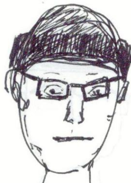
He looked a bit like this (my non-artists impression)

trousers and shoes. He left saying he was going to get some petrol. There was no sign of his van anywhere nearby. I subsequently found a fresh footprint inside my conservatory which was unlocked. He was obviously up to no good, so BEWARE!