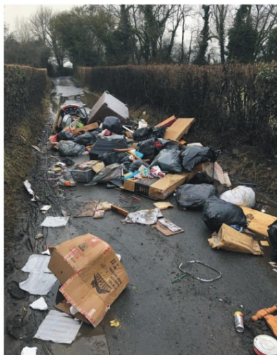
SKIBBS LANE ON 24TH DEC 2018

A VIEW FROM THE CAR WHEN ATTEMPTING TO DRIVE DOWN SKIBBS LANE ON THE DATES SHOWN. THIS IS NOT A ONE-OFF, IT IS NOW A REGULAR OCCURRENCE TO FIND THE FLY TIPPERS ARE USING THE LANE AS A CONVENIENT LANE IN WHICH TO SHED THEIR LOADS.