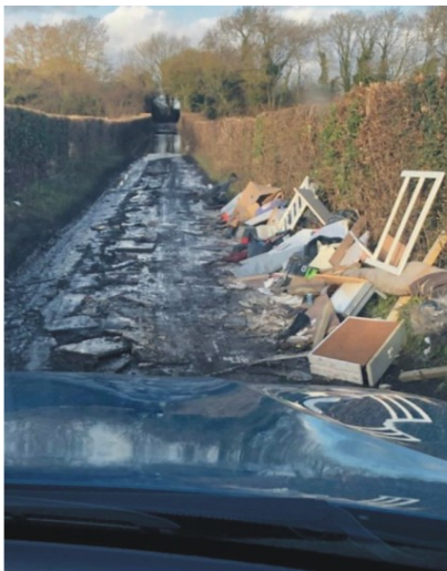
SKIBBS LANE ON 20TH DEC. 2018

pass these on to either the police (101), local authority (020 8464 4848) or even Chelsfield Village Voice (07414 920920). Please don't attempt to tackle the driver yourself.