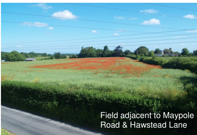
Field adjacent to Maypole Road & Hawstead Lane

So, talking of new plants appearing on the scene, this spring a new arrival