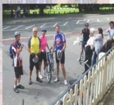
...it's just for fun...