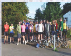
It's not a race...