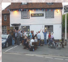
...and for charity of course!