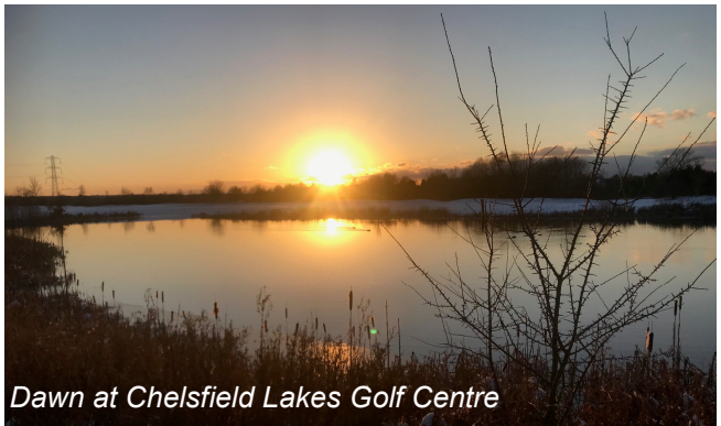
Dawn at Chelsfield Lakes Golf Centre